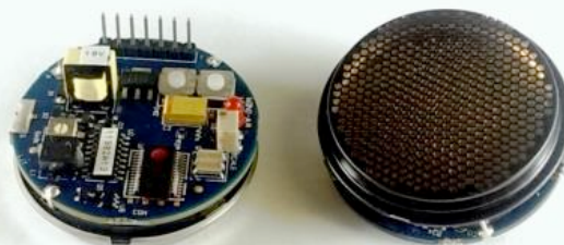
*PID# 616025LF Shown