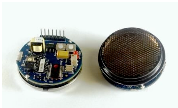
*PID# 616025LF Shown