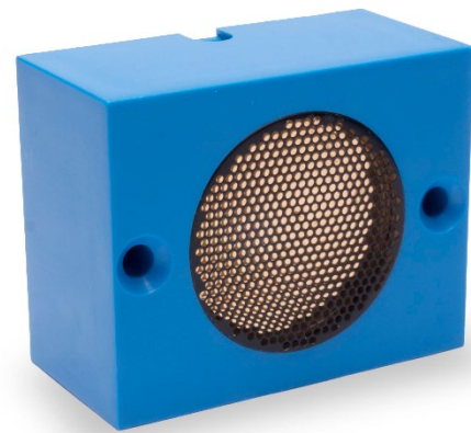
Enclosure shown with 600 series transducer NOT INCLUDED.